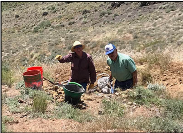
Digging for thundereggs at McDermitt