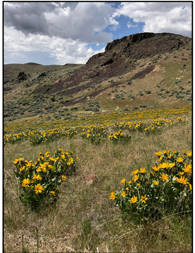
The McDermitt Hills in full bloom

Did you get some great photos during a recent rockhounding adventure? Send them in to be included in the newsletter!