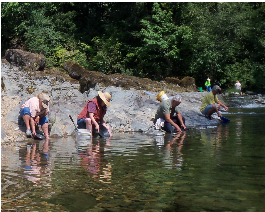
Our determined Argonauts looking for the big nugget

The cold watermelon Don provided was a great treat to cap the adventure.