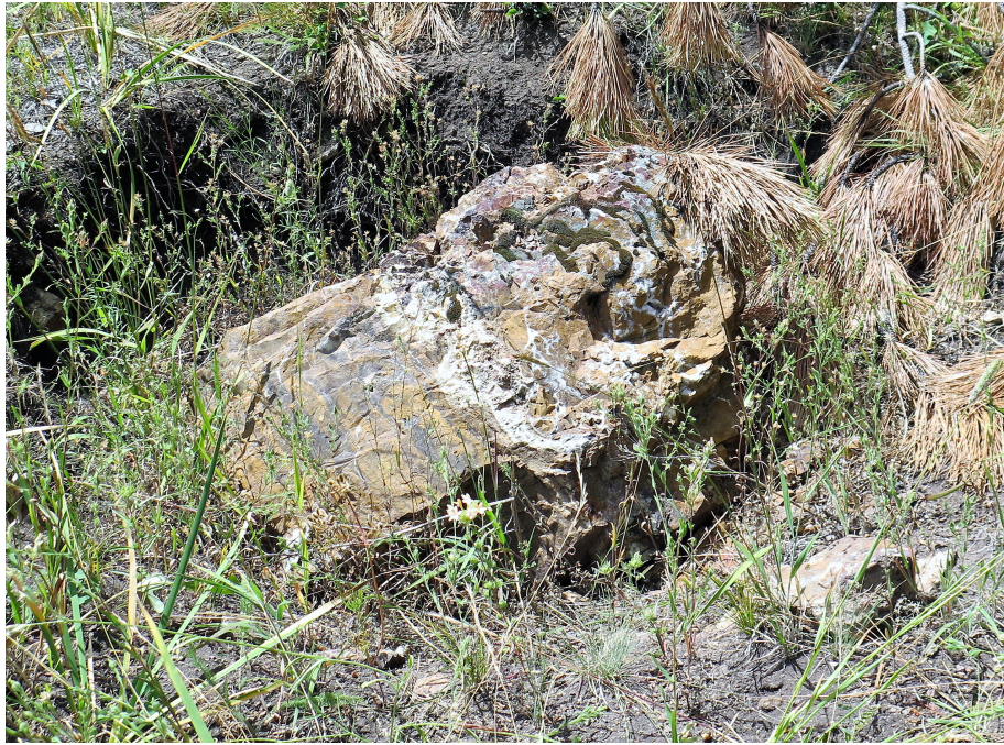
About a ton of banded jasper – one piece in place